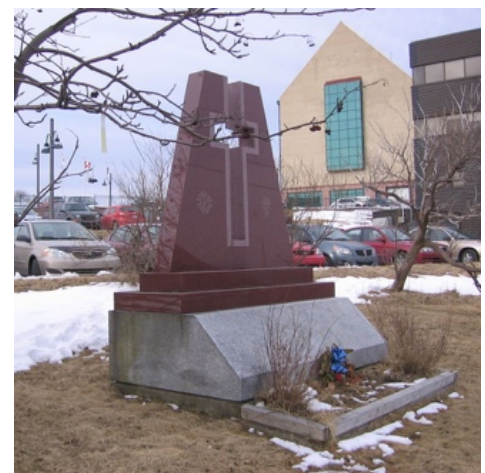
K of C Fire Memorial