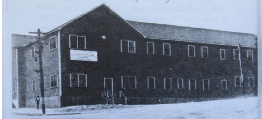
Knights of Columbus Hostel, erected December 1941