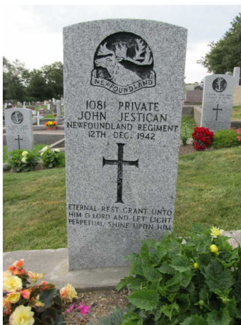
Mt. Pleasant Cemetery

Shortly after 11 pm a devastating fire erupted consuming the building in minutes. Eighty servicemen and 19 civilians died, and 109 others were severely injured. The cause of the fire was never definitely determined but arson was suspected and possibly, sabotage. John and the other 21 members of the Royal Newfoundland Regiment who were among the casualties were interred with full military honours at Mount Pleasant Cemetery, St. John's