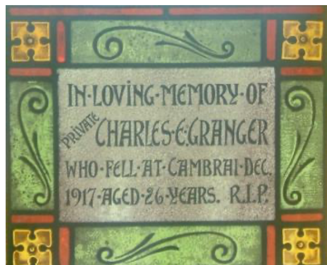
Memorial window, Mortuary Chapel, Trinity