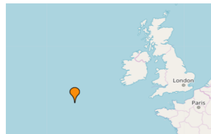
Position when sunk