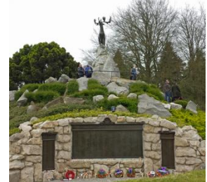
Beaumont Hamel Memorial