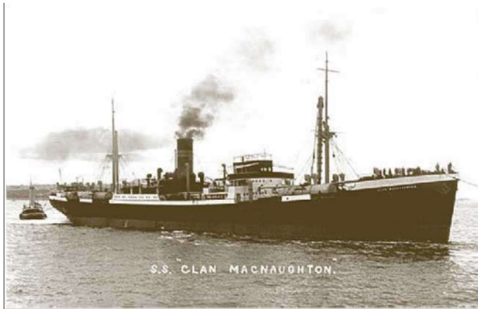
HMS Clan MacNaughton