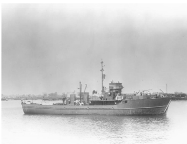
HM British Yard Minesweeper