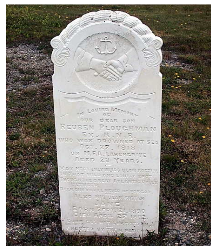
Port Rexton Cemetery