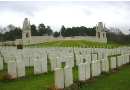
Etaples Military Cemetery