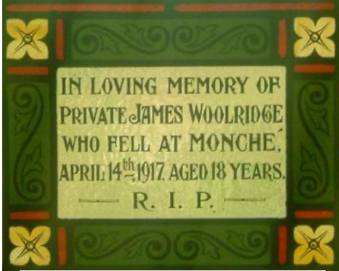
Memorial window, Mortuary Chapel, Trinity