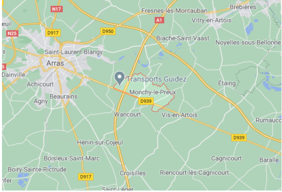
Death Location Monchy-Le-Preux