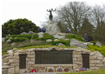
Beaumont Hamel Memorial